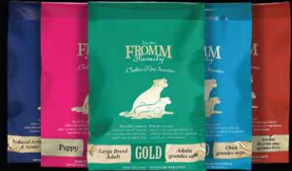
To find a retailer near you, visit frommfamily.com/retailers

At Fromm Family Foods, we pride ourselves on offering a wide variety of premium dog and cat foods produced using the finest ingredients. Countless families across the country trust us with feeding their four legged family members. We are honored to be selected as the Official Dog Food of Southeastern Guide Dogs Inc, providing nutritional excellence to their extraordinary dogs throughout the United States.